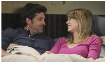
20 Shades of Grey: Highs and Lows of MerDer on 'Grey's Anatomy'