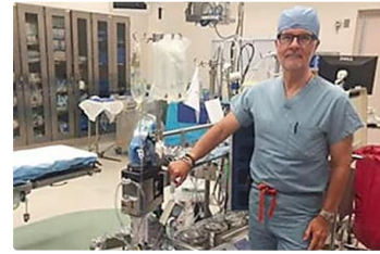
Cardiologist: "I Beg Everyone To Quit 3 Foods"

Everyone is worried about Torres, and Jack takes a run at Young to find out the location of the safe house. Gibbs sees Jack about to go into the observation room, and he tells her that she should go back upstairs. Gibbs enters interrogation and turns the camera off. Gibbs means business!