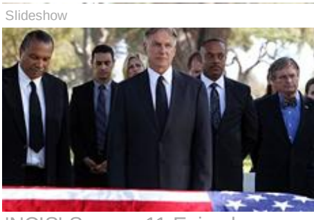
'NCIS' Season 11 Episode