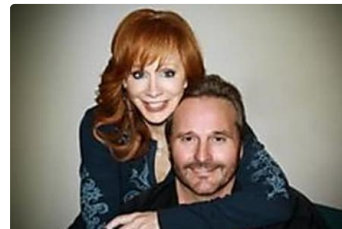
[Gallery] He Was The Love Of Her Life, But Then Reba's Husband Decided to Call It Quits Ice Pop