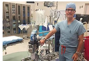
Cardiologist: "I Beg Everyone To Quit 3 Foods"